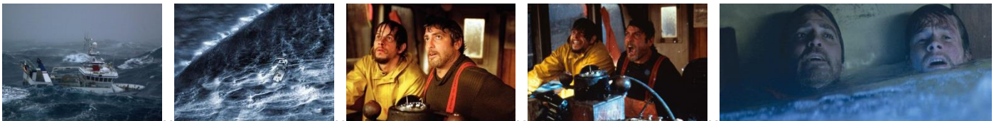
The Perfect Storm Movie.....Massive wave.....Yes I see that wave.....I think that wave saw us..... Jip it saw us!!!

Matthew 10:34-35 34 "Do not think that I have come to bring peace to the earth. I have not come to bring peace, but a sword. 35 For I have come to set a man against his father, and a daughter against her mother, and a daughter-in-law against her mother-in-law.