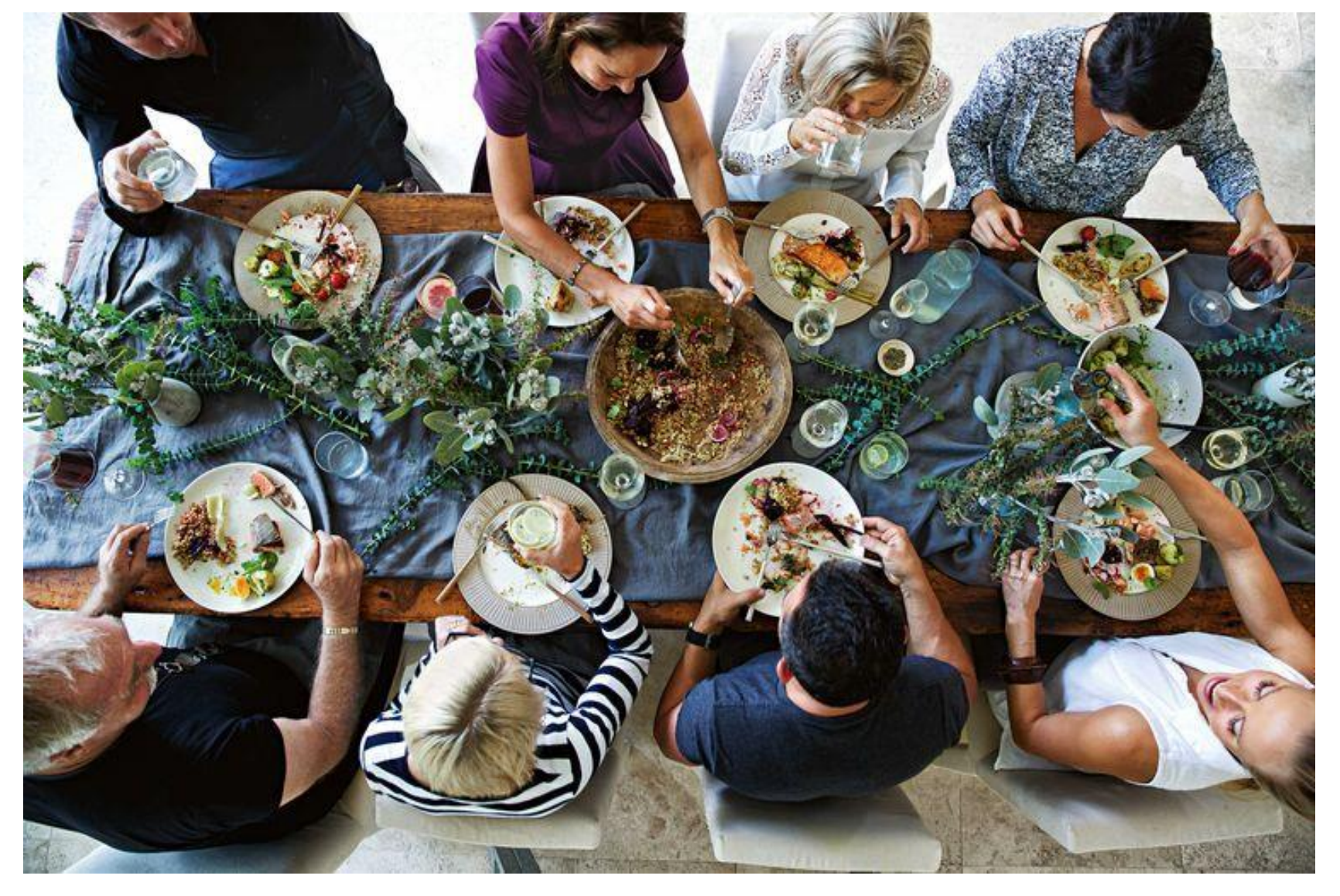
When a stranger receives you, he/she receives Christ. When you host a stranger, you host Christ. So set the table!