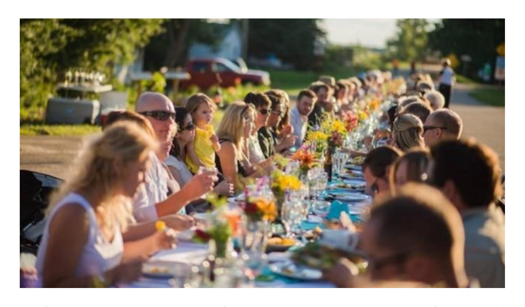
When we <u>eat</u> together more, we are <u>enlarged</u>!