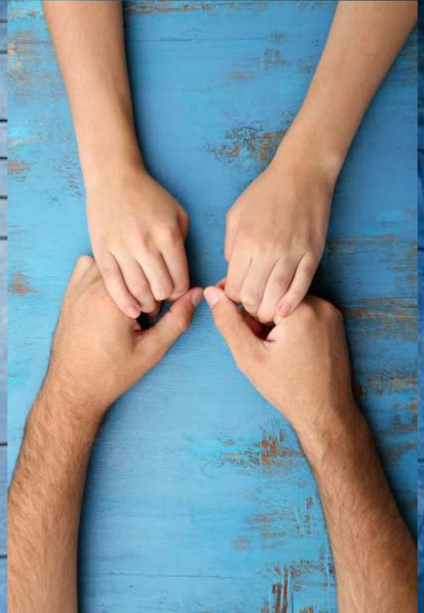
Illustration | Procreation

Then God saw everything that He had made, and indeed it was very good. God created everything and Then the LORD God said, " It is not good that the man should be alone; I will make him a helper fit for him."