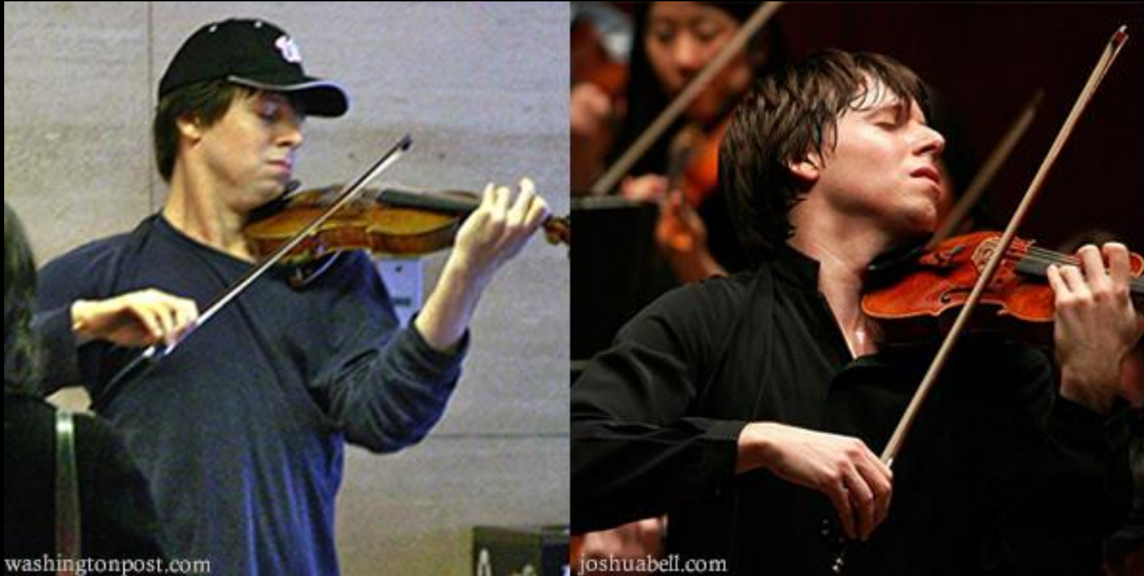
Joshua Bell, Washington DC station, 2007